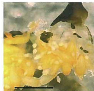
Fig. 3. Ovary of a Diaphorina citri female that contains mature eggs. Scale: 0.5 mm.