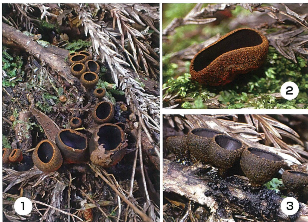
Figs. 1–3. Apothecia of Plectania melastoma in different developmental stages in its natural habitat (TMI-26361.) Figure 2 shows the granule-powdery surface of a receptacle in a mature apothecium, while Figure 3 shows the nearly smooth, matted fibrillose surface of a receptacle in weathered apothecia. Photo courtesy, T. Nakanishi (April 23, 2017).

water mounts), slightly gelatinized at times, loosely interwoven in a hyaline gelatinous matrix, but forming a compact, brown-tinted layer (thickness, 50–65 \mu\text{m} ) beneath the subhymenium. Ectal excipulum of textura angularis , approximately 60–80 \mu\text{m} thick, element cells mainly polyhedral (sometimes subglobose), 8–19.2 \times 6.4–17.6 \mu\text{m} , moderately thick-walled, walls pigmented dark brown (in water) or olivaceous black (in KOH solution). Hyphae on the receptacle surface dark brown, thick-walled [up to 1.2 (–3.2) \mu\text{m} ], 6.4–8 \mu\text{m} wide, sinuous or straight, infrequently septate, mostly simple, rarely bearing a short branch, smooth, often encrusted with reddish orange to reddish brownish granules that quickly dissolve in KOH solution and release wine-colored purple pigments.