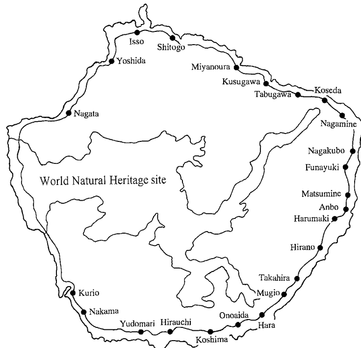
Fig. 1. Collecting and World Natural Heritage Sites on Yakushima Is., South Kyushu.

Material examined. 1♂3♀, Miyanoura, 13–31. V. 1999, T. Murata; 1♂, same locality, 13–31. V. 1999, T. Murata.